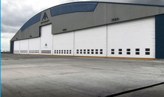
Multiple hangar door 100 x 16 m Philippines