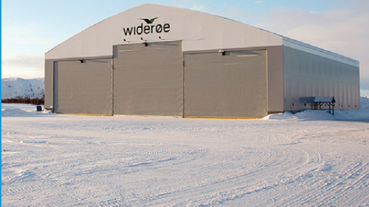
Multiple hangar door in Norway, 36 x 11 m