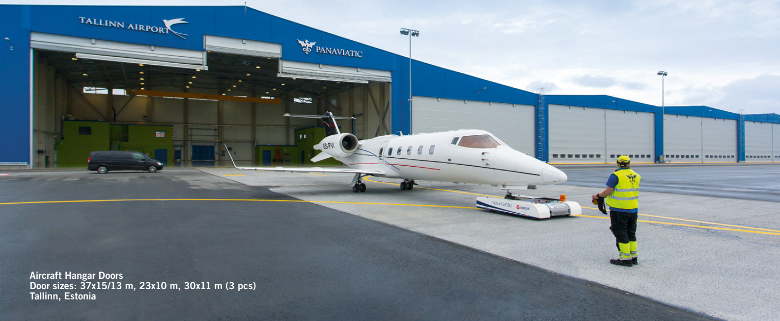
Aircraft Hangar Doors Door sizes: 37x15/13 m, 23x10 m, 30x11 m (3 pcs) Tallinn, Estonia

The innovative multi-leaf door system design with swing-up mullions permits to manufacture the door according to the aircraft fleet shape, with maximum space utilization.