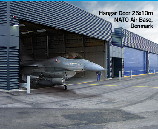
Hangar Door 26x10m NATO Air Base, Denmark